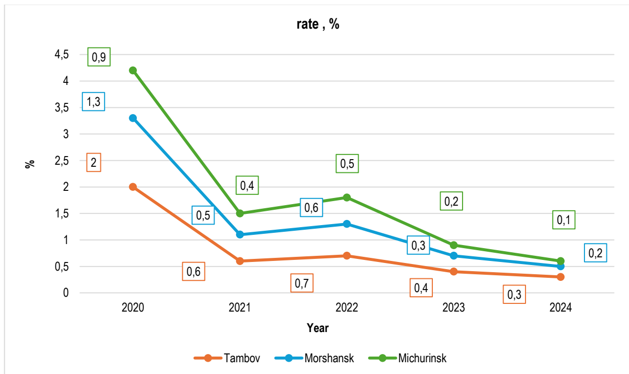
Figure 1 – The level of officially registered unemployment in urban districts of the Tambov region (using the example of the city of Tambov, Morshansk and Michurinsk) for 2020–2024 [22]

A study of the educational infrastructure of urban districts in the Tambov Region (using Tambov, Morshansk and Michurinsk as examples) identified the presence of a variety of educational institutions (schools, gymnasiums, colleges, and universities) in each of the cities [13]. Tambov's numerical superiority stems from its status as the administrative center and its more developed infrastructure. Morshansk and Michurinsk, despite having fewer institutions, provide access to high-quality education for the local population. The present-